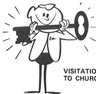
VISITATION IS THE KEY TO CHURCH GROWTH!