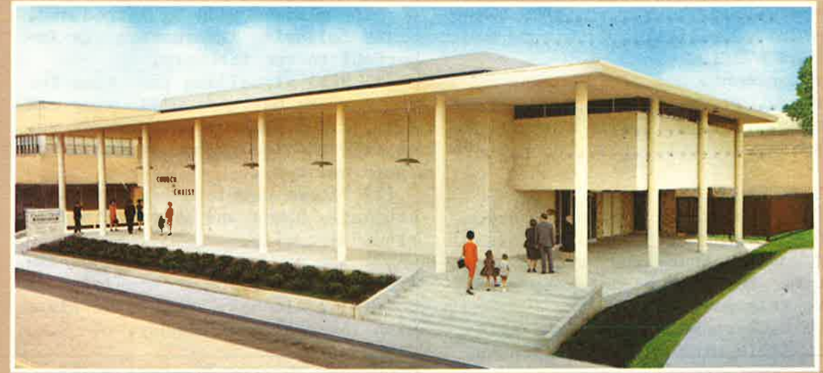
CHURCH OF CHRIST 420 W. ERWIN TYLER, TEXAS 75701