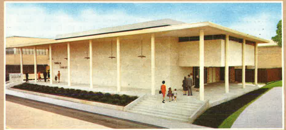
CHURCH OF CHRIST 420 W. ERWIN TYLER, TEXAS 75701

Parents, encourage your children to make the most of this prepared material by studying his or her lesson every week. (contd. inside)