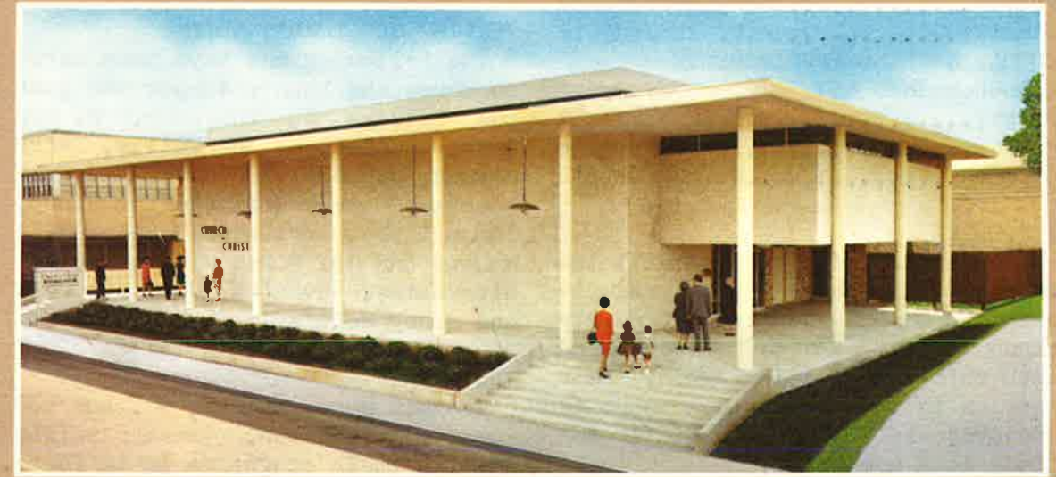
CHURCH OF CHRIST 420 W. ERWIN TYLER, TEXAS 75701