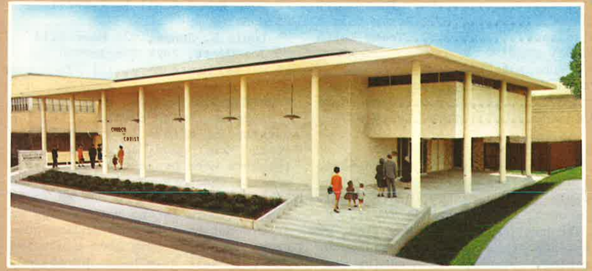
CHURCH OF CHRIST 420 W. ERWIN TYLER, TEXAS 75701