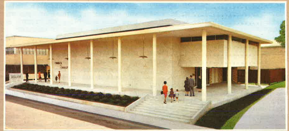
CHURCH OF CHRIST 420 W. ERWIN TYLER, TEXAS 75701