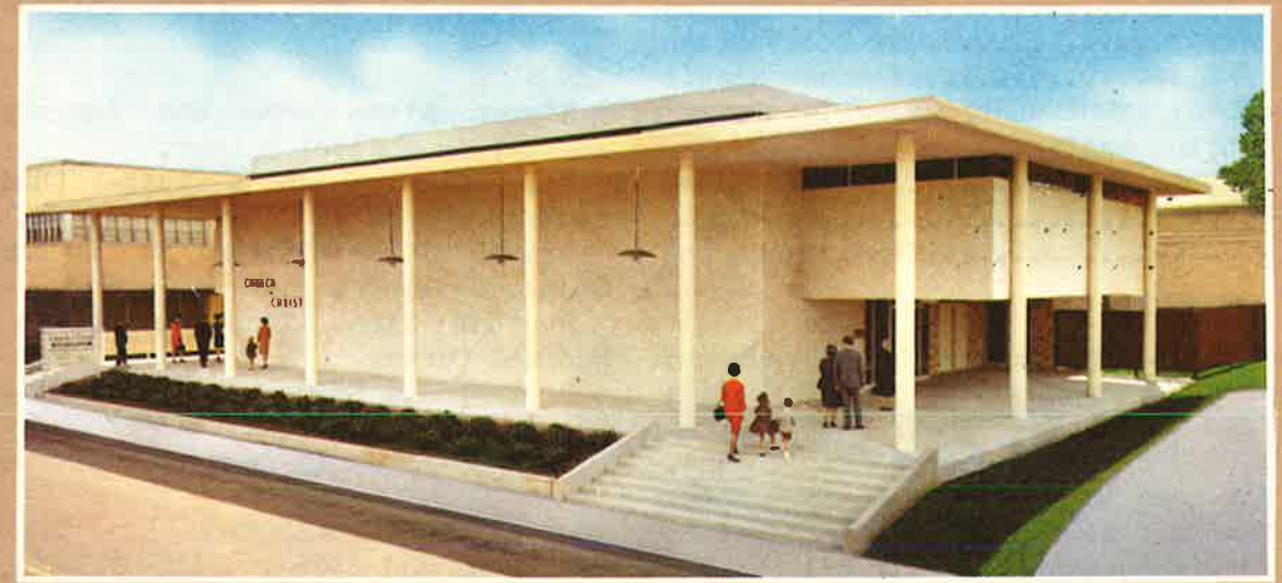
CHURCH OF CHRIST 420 W. ERWIN TYLER, TEXAS 75701